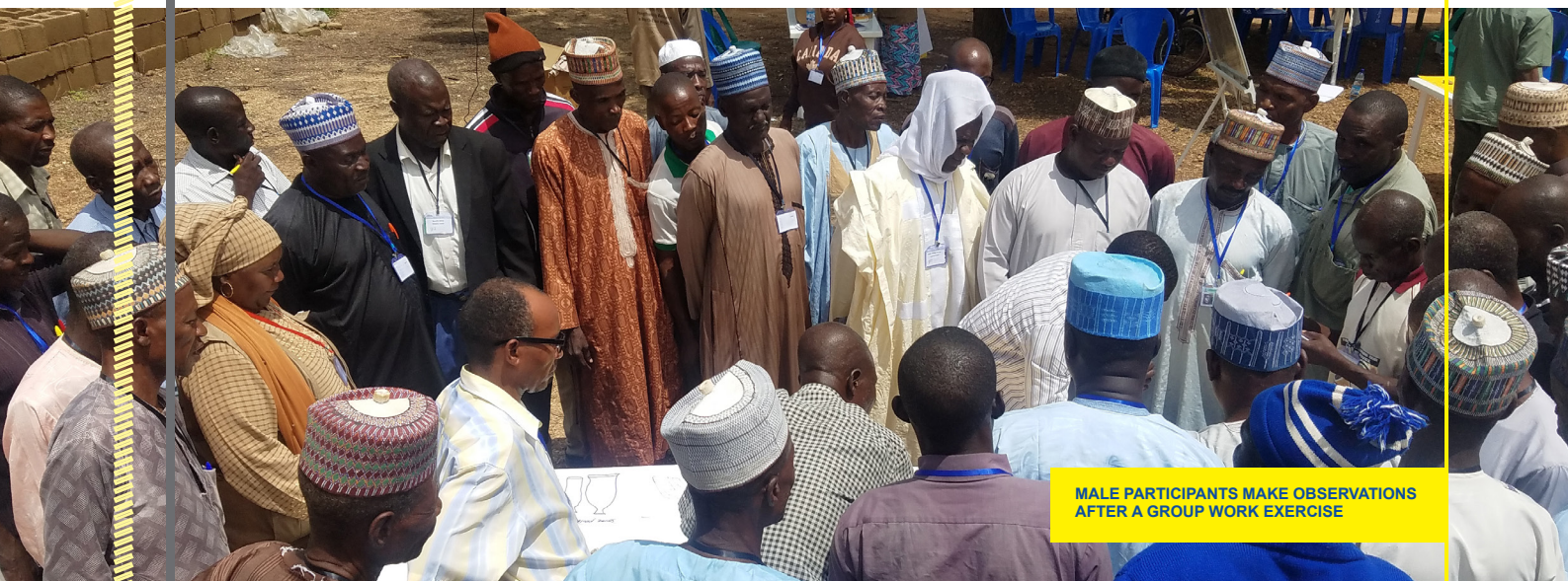
MALE PARTICIPANTS MAKE OBSERVATIONS AFTER A GROUP WORK EXERCISE