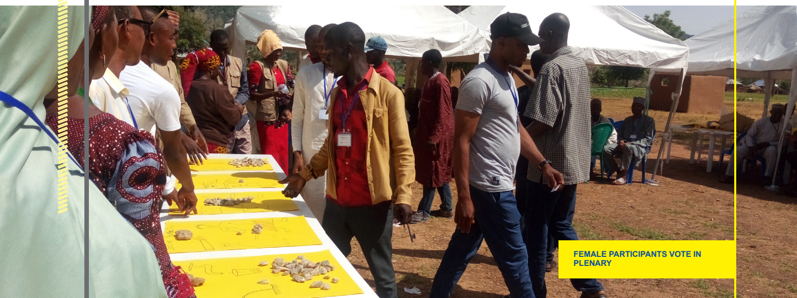
FEMALE PARTICIPANTS VOTE IN PLENARY