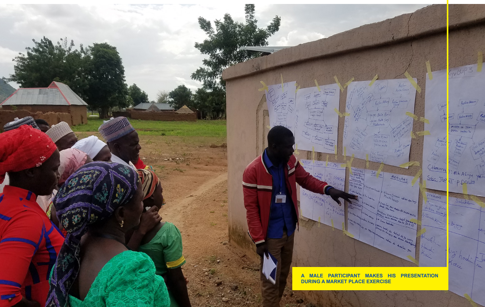
A MALE PARTICIPANT MAKES HIS PRESENTATION DURING A MARKET PLACE EXERCISE

In the tables below, you will find a summary of our discussions: