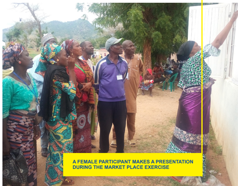
A FEMALE PARTICIPANT MAKES A PRESENTATION DURING THE MARKET PLACE EXERCISE