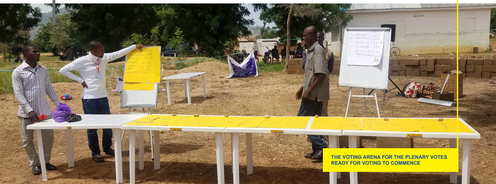
THE VOTING ARENA FOR THE PLENARY VOTES READY FOR VOTING TO COMMENCE