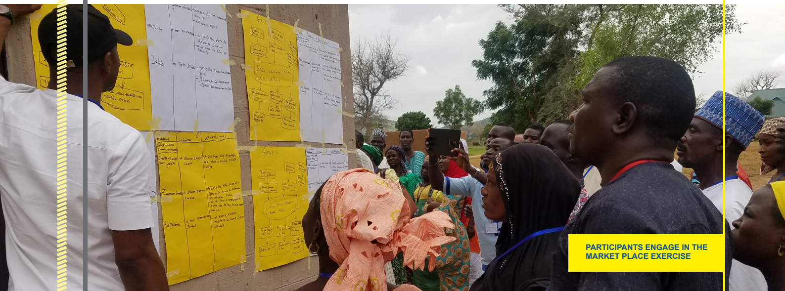
PARTICIPANTS ENGAGE IN THE MARKET PLACE EXERCISE