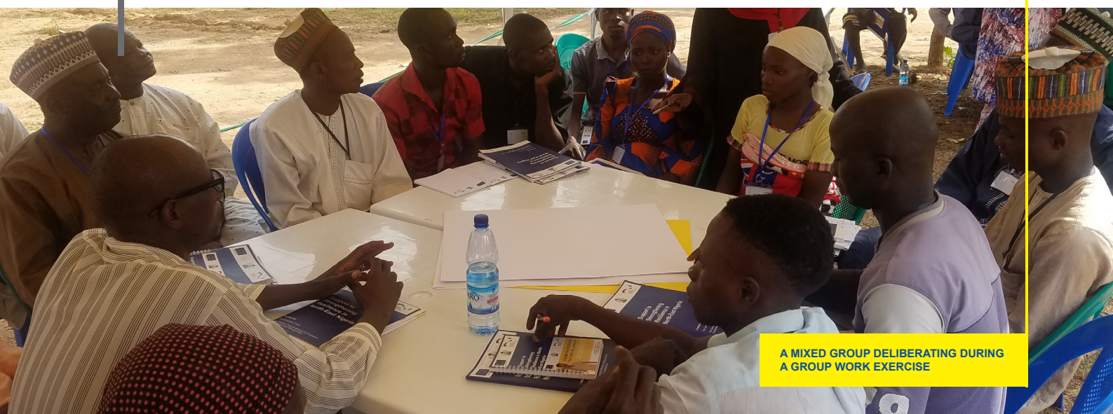
A MIXED GROUP DELIBERATING DURING A GROUP WORK EXERCISE