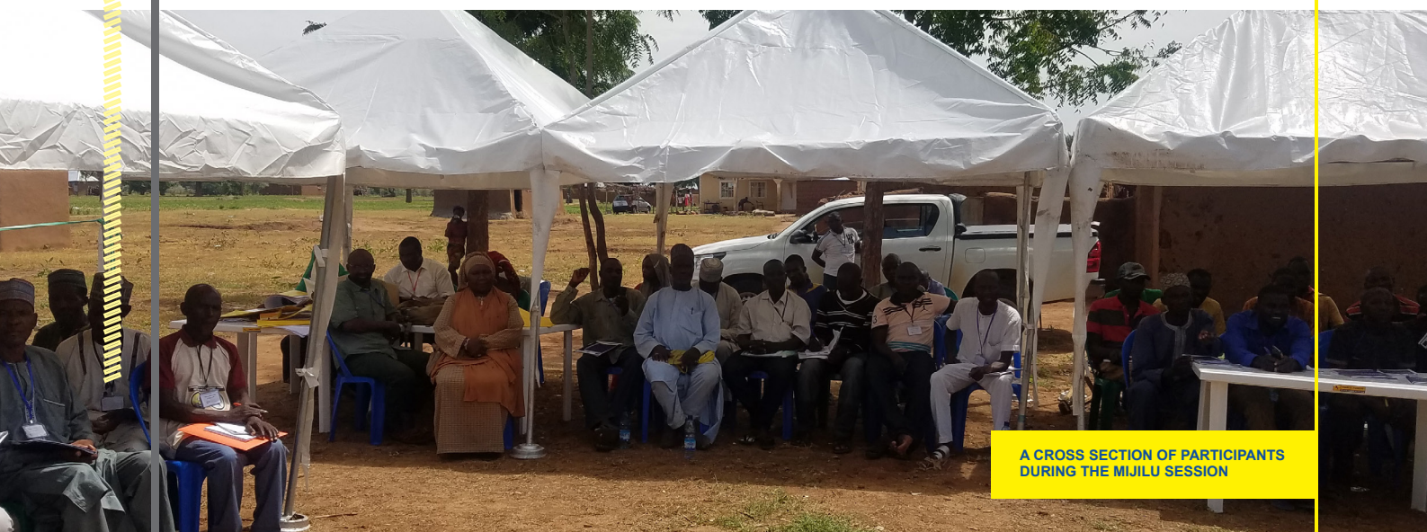
A CROSS SECTION OF PARTICIPANTS DURING THE MIJILU SESSION