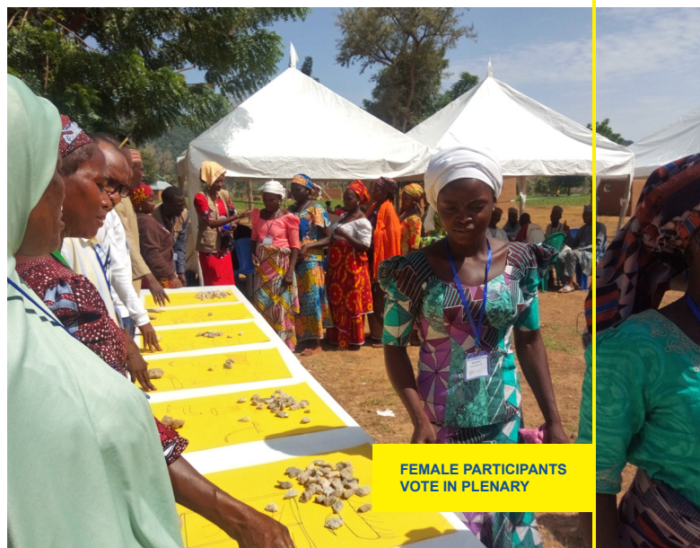
FEMALE PARTICIPANTS VOTE IN PLENARY

The tangible results of the Mijillu ward CDP process and especially the CDP session is this Ward Development Plan. This Plan and its content were validated by the representatives of the Mijillu ward.